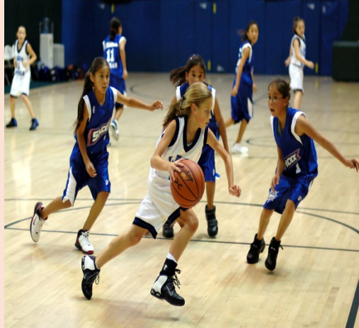
Children love playing winter sport

Keeping hydrated helps children stay focused, active and healthy.