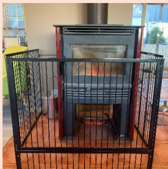
Use a securely attached fire screen

Never use ice, butter or toothpaste on burns.